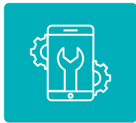
MOBILE DEVICE MANAGEMENT