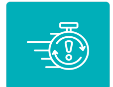
INCIDENT RESPONSE MANAGEMENT

A holistic solution with advanced features and benefits aligned with yacht business operations. Our cybersecurity services are aligned with internationally recognised best practise frameworks.