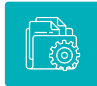
ADVANCED FILE MANAGEMENT