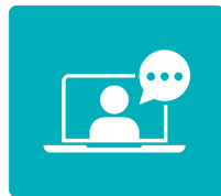
CYBER AWARENESS TRAINING